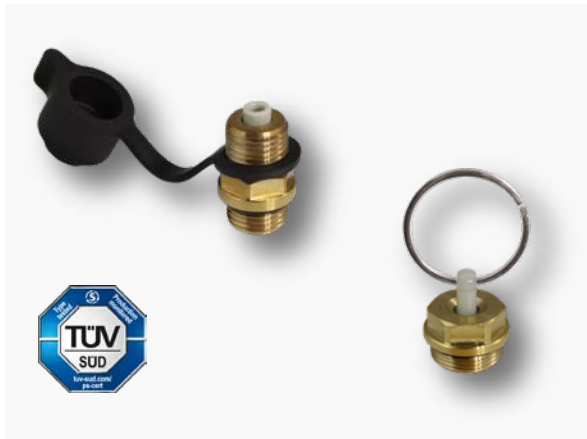
VT Line: Function Fittings for Air Brake Systems