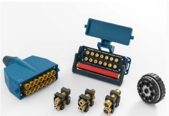
CO Line: Multiple Connectors