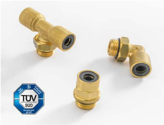
MT Line: Push-in Fittings for Air Brake Systems