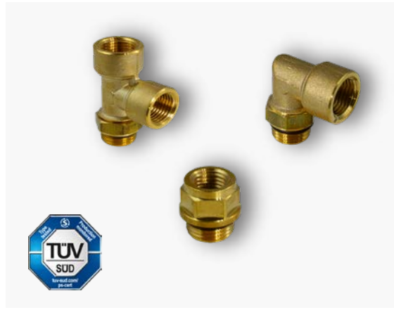
RT Line: Standard Fittings for Air Brake Systems