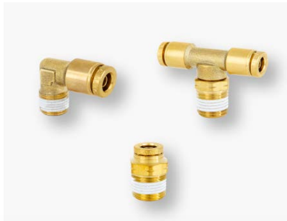
PT Line: DOT Push-in Fittings, Inch/NPT